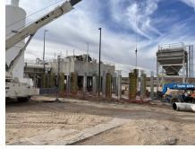
Construction at the Bustamante Wastewater Treatment Plant will help provide services to the growing East Side.